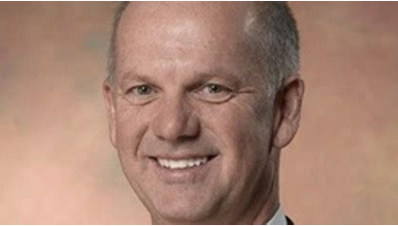
Canadian tire chairman of the board. Canadian tire chairman.